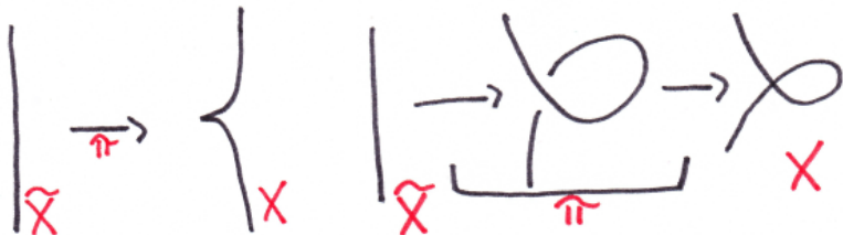
Figure: Normalisation of the curves from the previous example. Pictures reproduced from Eisenbud: Commutative algebra (1995), p. 141.

consider X = V(f) for f = y^2 - x^3 or f = y^2 - x^2(x + 1) \in \mathbb{C}[x, y]